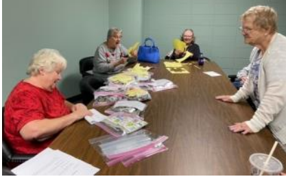
Ladies of WELCA making FROGS.