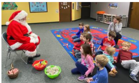
A little Christmas fun with the Sunday School kids and a visit from Santa.