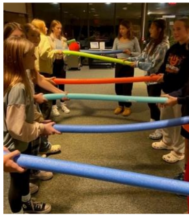
Youth Group/Confirmation Wednesday night enjoying games and activities together.