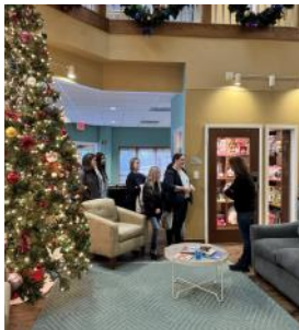
Youth delivering the FROGS to Ronald McDonald House.