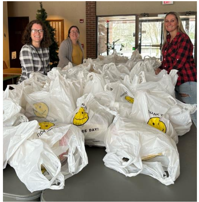
Packing up the turkeys for the Thanksgiving food drive.